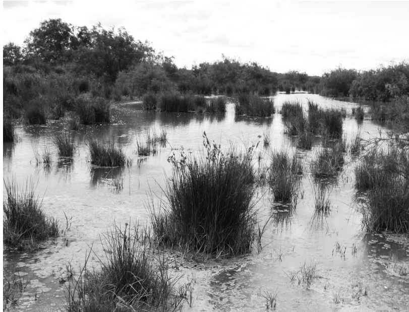
Figure 2 – Example of Lestes macrostigma breeding biotope in MdV: Juncus maritimus is a dominant species within the phytocenosis.